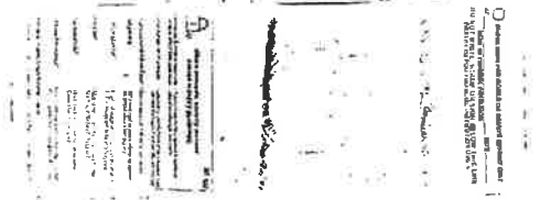
Check # 3166, Posted 01-07-25, Amount 2,000.00